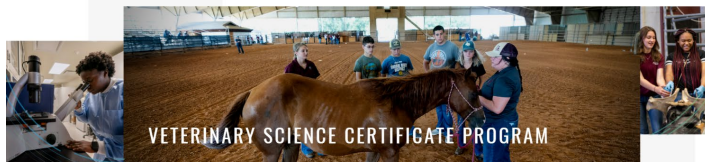
VETERINARY SCIENCE CERTIFICATE PROGRAM