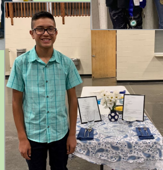
Northern District Contest