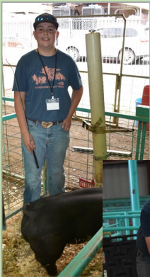
Northern Regional Livestock School