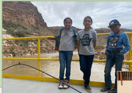
Abiquiu Dam Tour